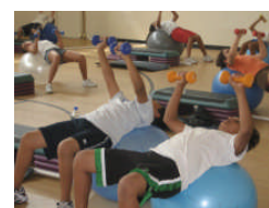
Participation in the Fitness Classes is fun for everyone.