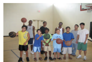
Together for Open Basketball, impromptu and lots of fun.