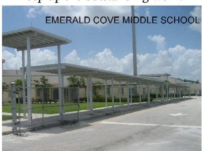
Congratulations and good luck to Emerald Cove Middle School as they begin their first year.

We all need someone who inspires us to do better than we know how to.