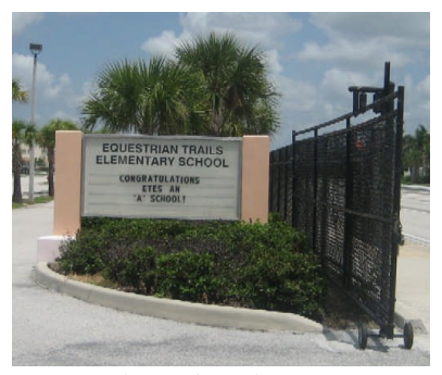
Much continued success to Equestrian Elementary School. Keep up the outstanding work!

Olympia salutes its neighboring schools, conveniently located across from the Donahue Way entrance. School starts Wednesday, August 22nd! Students walking to or from school are asked to use sidewalks and be respectful of private residences, landscaping and roadways. If you transport your student, please remember to drop-off and pick-up your student at the school provided Parent Pick-up. No standing or parking will be permitted on Donahue Way from Pierson Rd. to Fatio Blvd. This will ease in the congestion at peak times at our Donahue Way entrance and ensure safety for all. We appreciate your cooperation in advance.