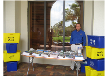
Village of Wellington