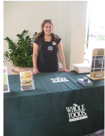
Whole Foods Market