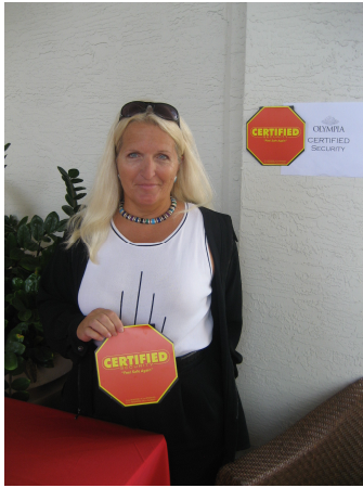
Certified Security Services, Inc.