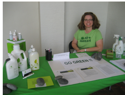
Wow Green Company