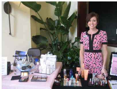
Mary Kay Cosmetics