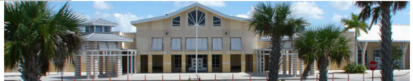
PALM BEACH CENTRAL HIGH SCHOOL 7:30AM TO 2:50PM