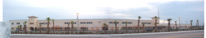
EQUESTRIAN TRAILS ELEMENTARY SCHOOL 8:00AM TO 2:05PM